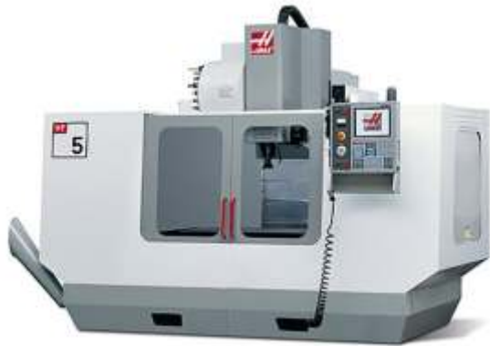
Table size 1321 x 584mm