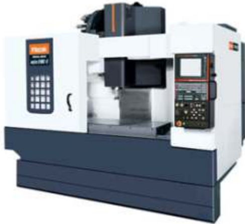
Table size 1300 x 550mm